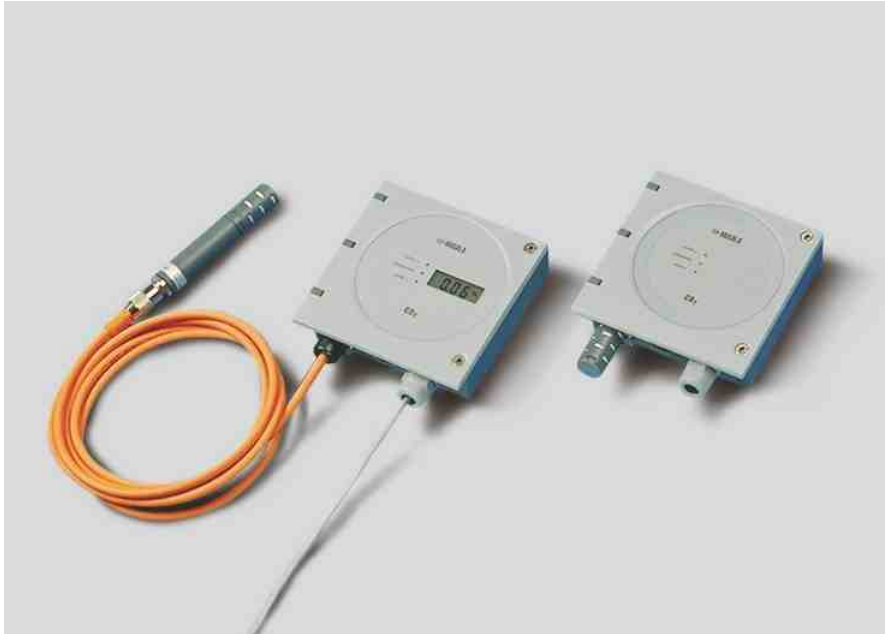
The GMT220 transmitters withstand harsh and humid environments.